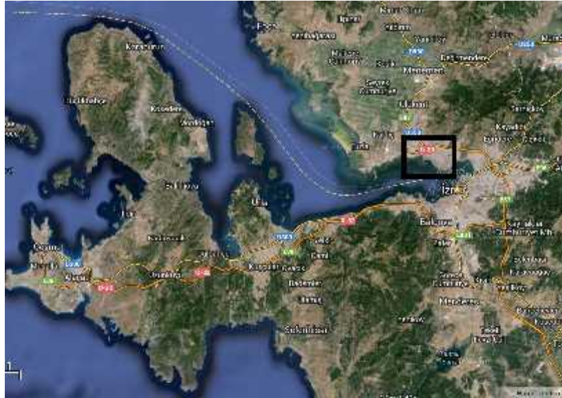
Figure 1 Location of Mavi ehir in Izmir Bay

Metropolitan Master Plan of Izmir. The area, totaling 270 ha, is surrounded by Atakent housing units to the east, by old Gediz river bed to the west, by a mass housing area that was previously a squatter housing area to the northeast by Izmir-Manisa-Ankara railway triage area to the north, and by Izmir Bay to the south (Figure 2). Mavi ehir mass housing area is formed by three sub- regions which were constructed in three stages (Mavi ehir I, II and III) with subsidies of the Housing Credit Bank. In addition to the housing units, the projects also includes social and leisure facilities such as sports areas, green areas, parking areas, playgrounds, education and commercial areas. With having a gas central heating system, double glazed windows, sun blinds, decorative coated doors, and double bathrooms; each accommodation in Mavi ehir is a luxury residential high-rise apartment and villa (Özçelik 1998, Koç 2001, Aydo an 2005).