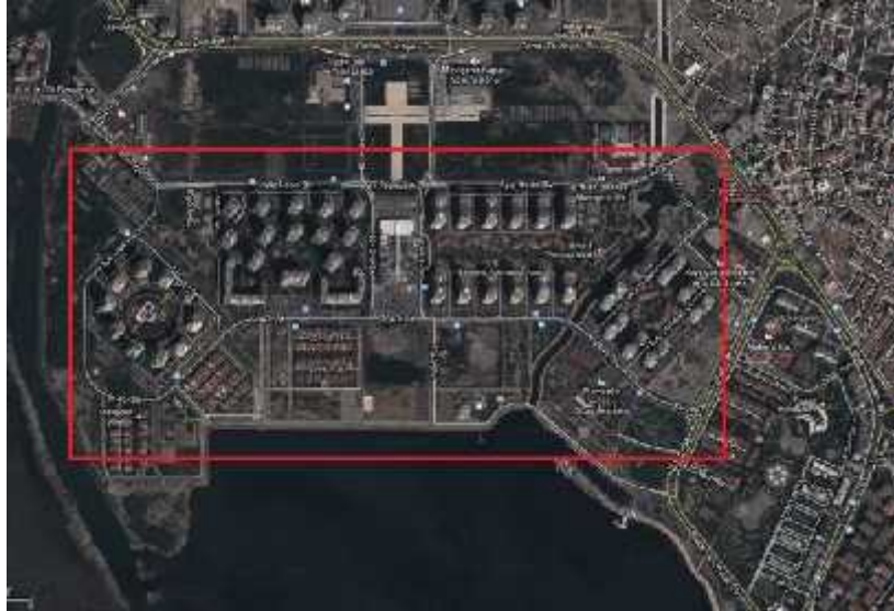
Figure 2. View of Mavi ehir Project