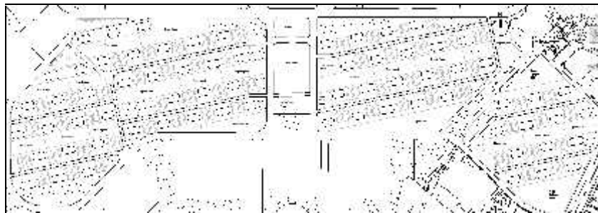
Figure 3. Site plan of the new alternative (Mert, 2014)

infrastructures like playgrounds, green areas, sports area, parking area, and social, cultural and educational areas were also considered and evaluated within the frame of the study (Figure 3). Due to the increased height of the buildings, the distance between them could also be kept higher. This helps to obtain a low number of buildings in a given area, and as the number of floors is also high, total number of housing units actually increases. The general and detailed 3D models of the eight-floor plans are shown in Figure 4. Like the four-floor plan, eight-floor plan also shows that the distance between buildings and their orientation has a positive effect on the shadow effect, where with the design, shadows of the buildings are not blocking the other buildings' solar gain.